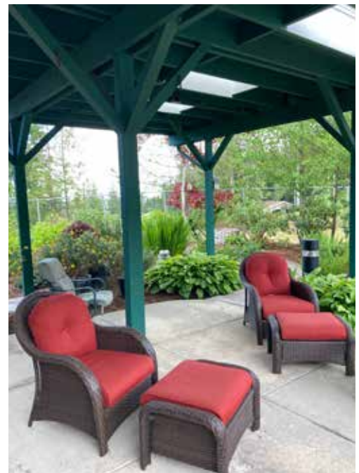
The beautiful Hospice gardens which are maintained by volunteers from the Rotary Club of the Sunshine Coast and SCHS.