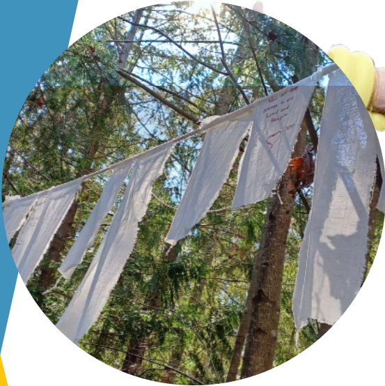
Solace flags with messages written by attendees of the Winter Tea in early December, hanging in the forest next to Hospice House.